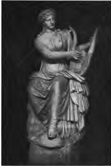
Fig. 38. Terpsichore.

Eolus. The winds were under the control of Æ'olus, to whom Zeus gave the power to rouse or to quiet them. In a vast cave in one of the volcanic Lipari Islands, he and his twelve boisterous children, the winds, lived a life of feasting and merri-